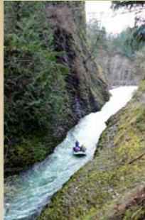
Rafting the Molalla

Numerous opportunities for viewing pools, rapids and unique geologic formations abound.